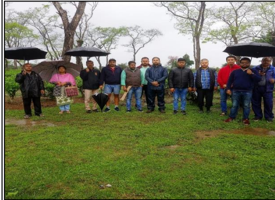
Zirat survey in Tinsukia Sub-Project