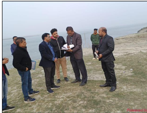
Field visit of Dy. CEO-FREMAA in Goalpara Sub-Project area