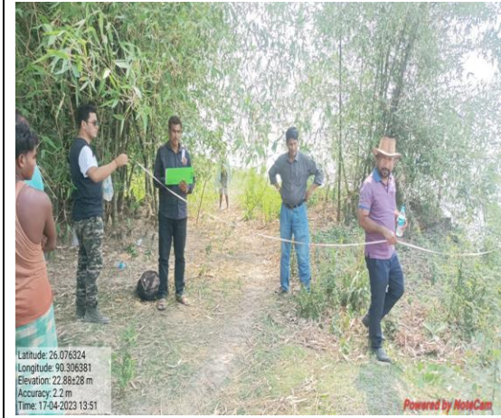
Land demarcation survey at Goalpara Sub-Project