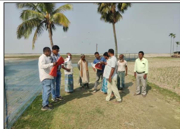
Land measurement survey with Revenue Officials in Morigaon Sub-Project