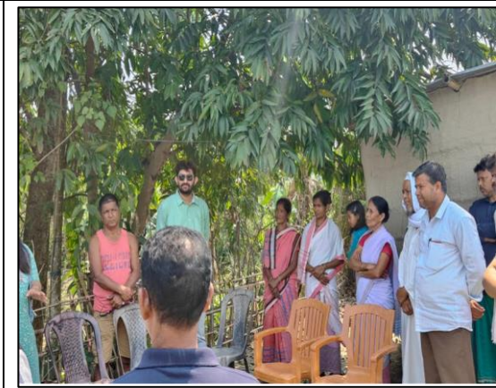
Community consultations at Palashbari sub-project under Kamrup district