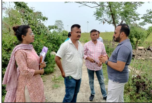
Field Visit of ADB Consultant along with Officials in Dibrugarh District